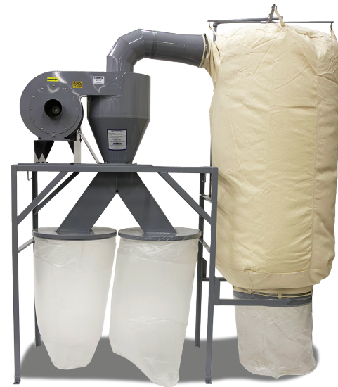
22/5 VK compatible with SEM Air System, shown above.