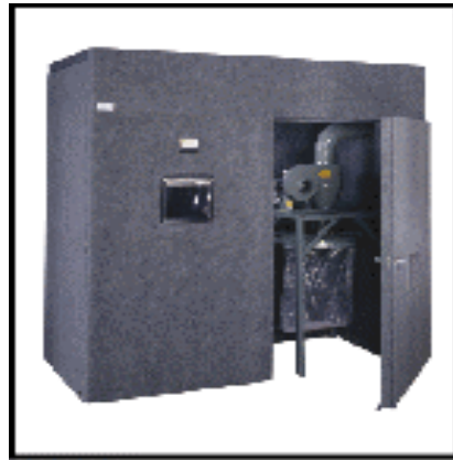
COMPETITIVE ENCLSOURE: Carpeted Plywood Construction