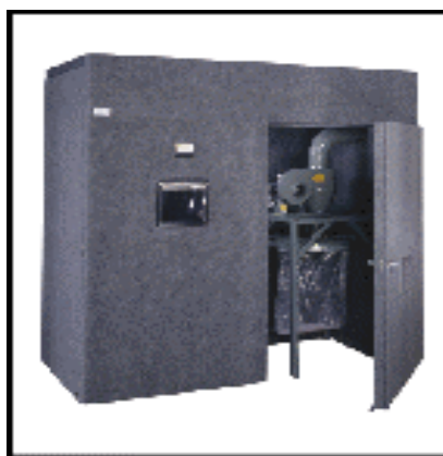
COMPETITIVE ENCLSOURE: Carpeted Plywood Construction