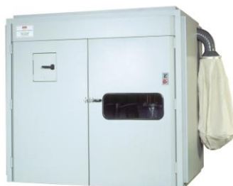
Closed Door View