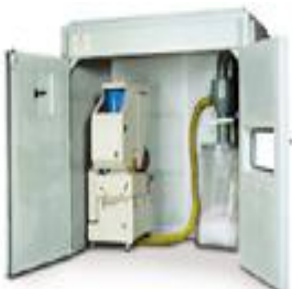
SEM MX SOUND ENCLOSURE: Insulated Steel Construction